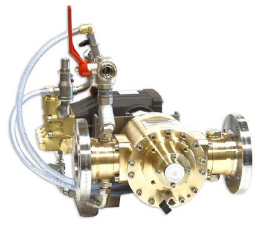
FIREMIKS 1200-3-PP-F-BRZ-DRV, equipped with optional Dosing return valve (DRV) and Pressure relief valve (PRV)

FIREMIKS is a water driven volumetric proportioner for firefighting – for fixed installations connected to a concentrate tank with gravity feed to the dosing pump. Extinguishing water drives the volumetric water motor, which in its turn drives the positive displacement pump that doses the correct amount of concentrate in the extinguishing water exiting the water motor.