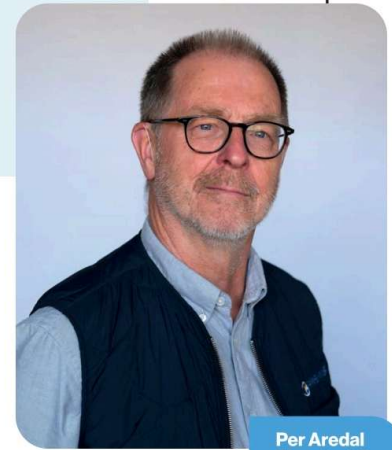
Per Aredal Firemiks AB

Piston pump models use a reciprocating mechanism in which the plunger draws in and then expels concentrate in each revolution, taking the fluid from zero to maximum shear rate twice per cycle. For lower viscosity and non-Newtonian concentrates up to FM-approved viscosity, this works well and the piston configuration performs particularly effectively in applications with low start-up flows relative to